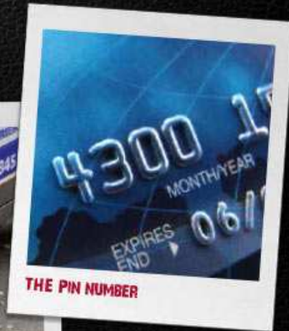
THE PIN NUMBER

3 They send a taxi/courier to you to collect your bank card. With this and your PIN, they spend your money.