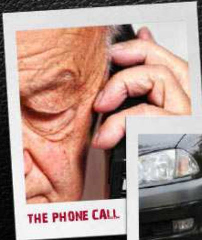
THE PHONE CALL

2 They suggest that you hang up and ring the bank/police back to ensure the call is genuine. Don't be fooled – they stay on the line. They then tell you to read out or key in your PIN.