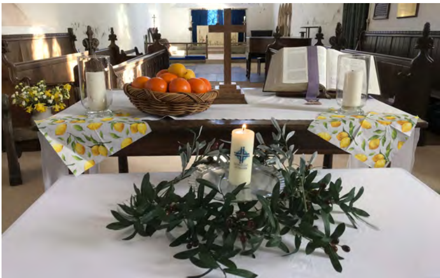
Altar from the World Day of Prayer service held in Westleton Church on 1st March, decorated with citrus fruits and olive branches, each detail of the service prepared some time ago by Christian women in Palestine.